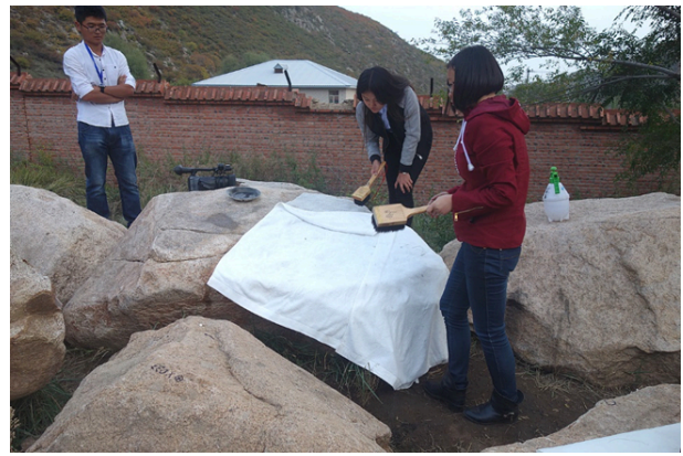
Figure 3. Stamping the paper mâché into place with stiff brushes.

Therefore, the specialists requested that the recording procedure be demonstrated. Two members of the recording team obliged, placing thick paper over a rock, spraying it lightly with water, covering it with a thick cloth and stamping the paper mâché into position with stiff brushes (Fig. 3). The cloth was then removed and the paper allowed to dry for an hour. Rather than by rubbing, the black pigment was then applied by stamping with small brushes, each of the two operators commencing from a different part of the panel. This is obviously much gentler than rubbing, and the objective was to emphasise rises in the surface and avoid depressions, as would be the case in rubbing. After several minutes, the recorders were asked to pause, and the specialists examined their work closely. There was no correspondence between depressions on the rock and blank areas in the pigment; the pigment had been applied independent of the surface topography. Amazingly, it had begun to outline blank areas, forming grooves that allowed a single design to emerge. All this had taken place without verbal communication between the two operators, who had commenced in unison to produce one of the stylised face arrangements. Other recorders were then asked to show the process of highlighting supposed petroglyphs with black paint, and again, it was entirely clear that their lines were not following any real grooves or depressions on the rock.