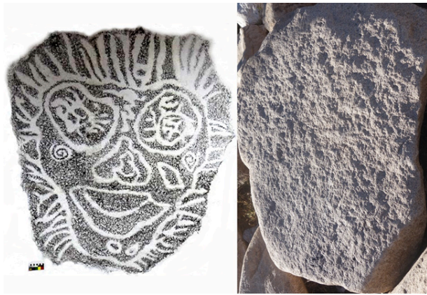
Figure 2. Recording taken from one boulder in the Xiaojinggou salvage yard, and view of the same panel in identical orientation.

Therefore, the specialists requested that the recording procedure be demonstrated. Two members of the recording team obliged, placing thick paper over a rock, spraying it lightly with water, covering it with a thick cloth and stamping the paper mâché into position with stiff brushes (Fig. 3). The cloth was then removed and the paper allowed to dry for an hour. Rather than by rubbing, the black pigment was then applied by stamping with small brushes, each of the two operators commencing from a different part of the panel. This is obviously much gentler than rubbing, and the objective was to emphasise rises in the surface and avoid depressions, as would be the case in rubbing. After several minutes, the recorders were asked to pause, and the specialists examined their work closely. There was no correspondence between depressions on the rock and blank areas in the pigment; the pigment had been applied independent of the surface topography. Amazingly, it had begun to outline blank areas, forming grooves that allowed a single design to emerge. All this had taken place without verbal communication between the two operators, who had commenced in unison to produce one of the stylised face arrangements. Other recorders were then asked to show the process of highlighting supposed petroglyphs with black paint, and again, it was entirely clear that their lines were not following any real grooves or depressions on the rock.