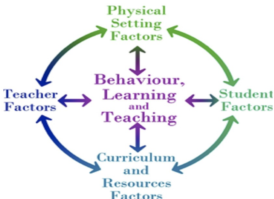
Figure 1. Factors influencing the education model

These resources can provide a solid foundation for understanding the evolution and impact of digital education in the context of the digital age. It is important to continue to explore the literature to stay abreast of the latest research and trends in this ever-changing field.