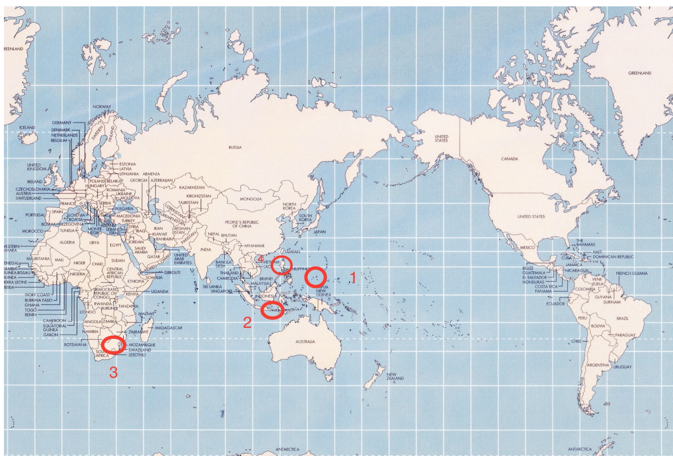
Map 1. #1 location Palau #2 Flores #3 Rising Star Cave #4 Luzon.

This last topic touches on the same problem as in our last section, tracing domestication. Humans raised as slaves underwent a number of selective pressures of their owners. One of the most important from the standpoint of the use of slaves on large plantations or productive services in workshops is the selection for docility and ability to train for different operations with varying skills. While some evidence has appeared in genetic studies that selection during slavery has had some effects [109] , this evidence is weak and the study population too diverse and too mixed (especially with Southern Euroamerican populations) in time to retain any such effects [110] . Since historic evidence indicates that most slave populations interbred with the dominant population, either illicitly or by marriage and adoption, there has never been a distinct captive population in human history (e.g. [111] ). Also, it would not explain the small-bodied hominin context where only small-bodied individuals are found without other sized hominins. While this could be an artifact of preservation, it seems unlikely even though their fossils were always found in caves.