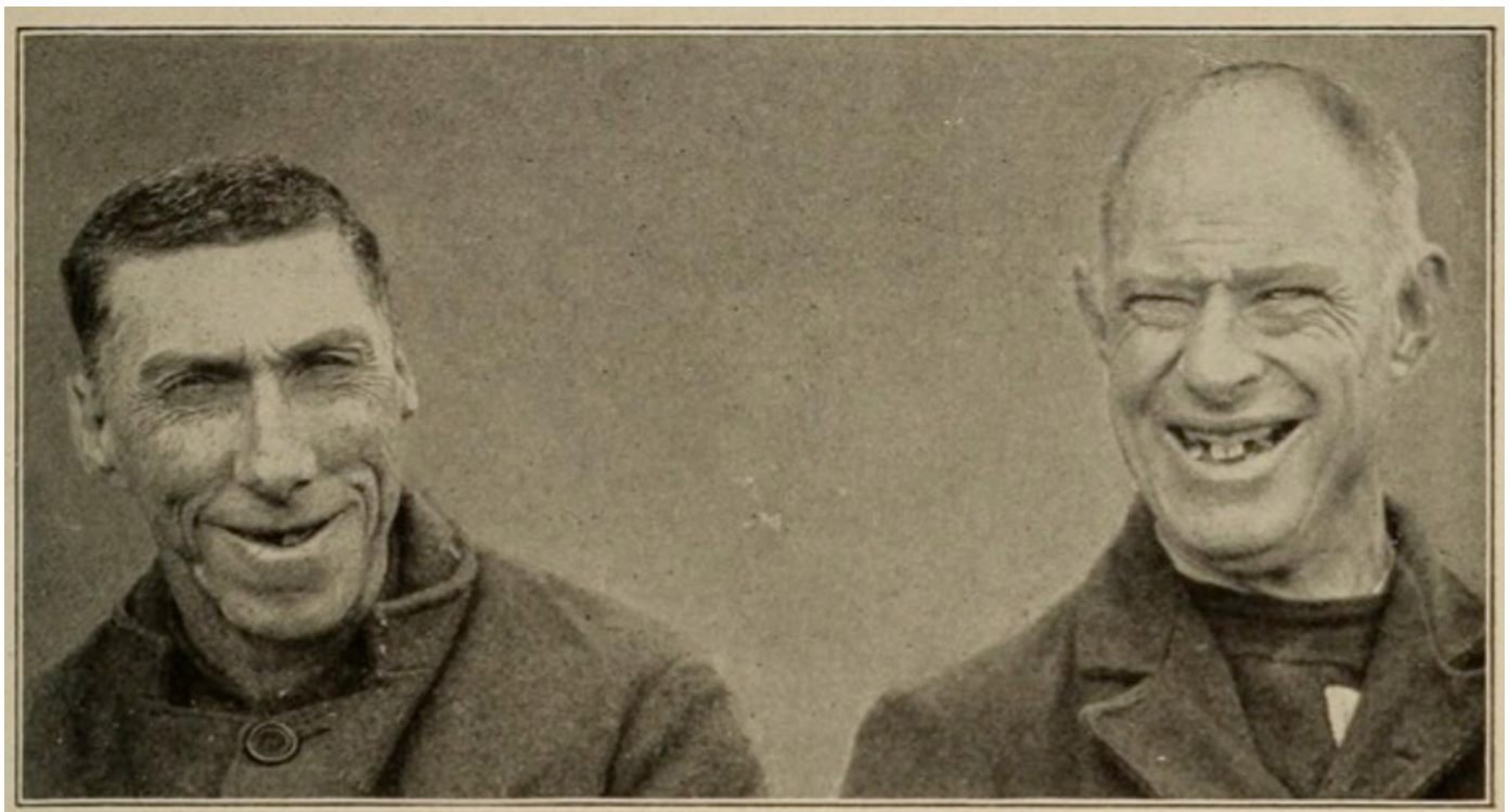
Figure 1. What is considered a microcephalic both behaviorally and morphologically has differed over the past 200 years. In the above image, the individual on the left was diagnosed as a microcephalic. Image from Church & Petterson [60] . Variation in frequency, especially rate of twins in Berg & Kirman [61] .

al. [25] , whose own excavations in the island and caves of the finds dispute isolation which would be necessary for dwarfing to occur unless extreme forms of contact avoidance were instituted as among the Andaman Islanders even today. Thus, the question of how unique these cases are may represent pathology or adaptation in the Flores example, or insular dwarfism in the Palau example, as they generally fall within the range of certain local groups of Andaman Islanders (Onge). However, the small brain size in relation to scaling of body size reduction seen in island dwarfing, is too extreme in the small bodied hominins [53] . This finding is contradicted by that of Gordon, et al. [3] , yet in their analysis the Homo floresiensis sample consistently falls either outside the hominin ranges or at the extremities. But the effects of mummification and different conditions of preservation should also be considered, as in the cases of the Alaskan and Aleutian mummies [54] , in the case of Palau and the Rising Star Cave finds, or Homo naledi [45][21] . Some ideas that the Rising Star Caves had been disturbed or entered from other directions have been reassessed [55][56][57][58][59] .