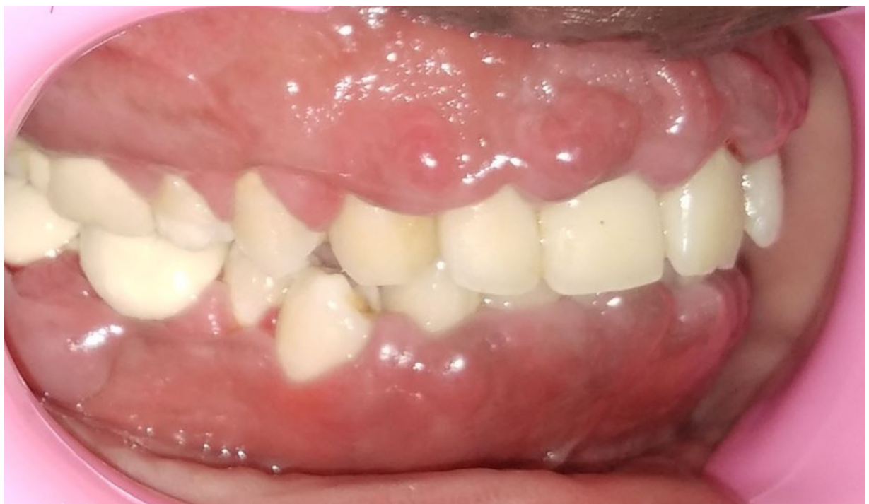
Figure 2. Pre-operative picture of gingival overgrowth (right profile)