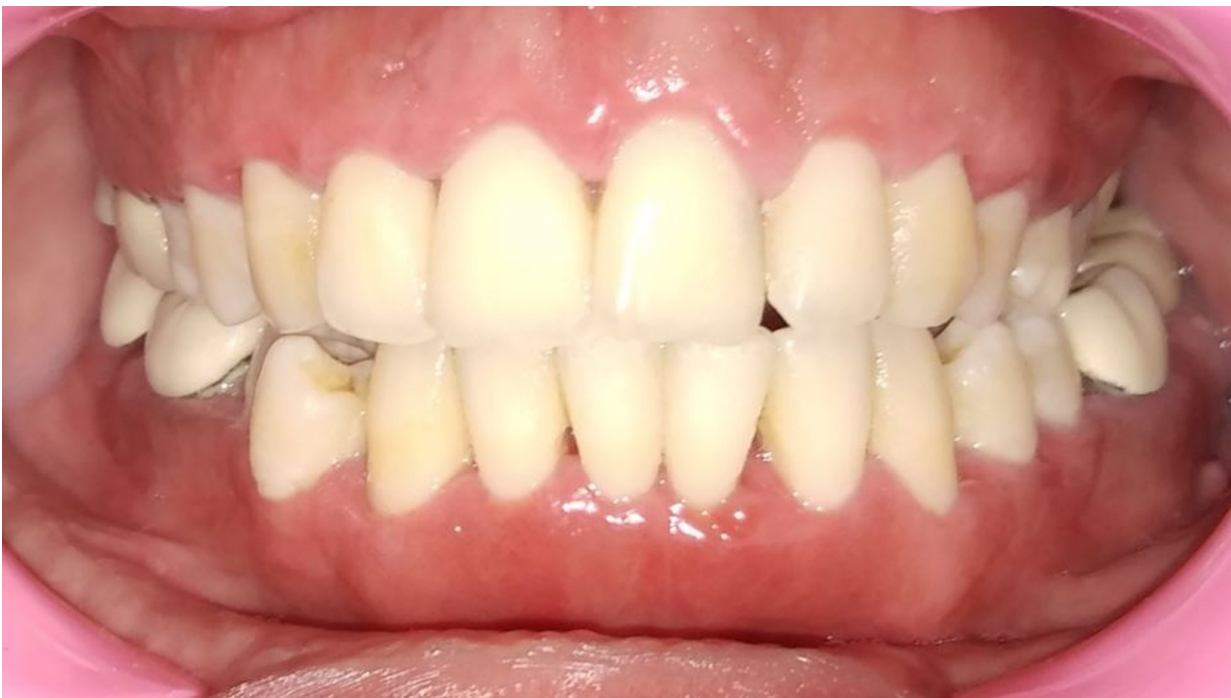
Figure 4. Three months follow-up picture (front profile)