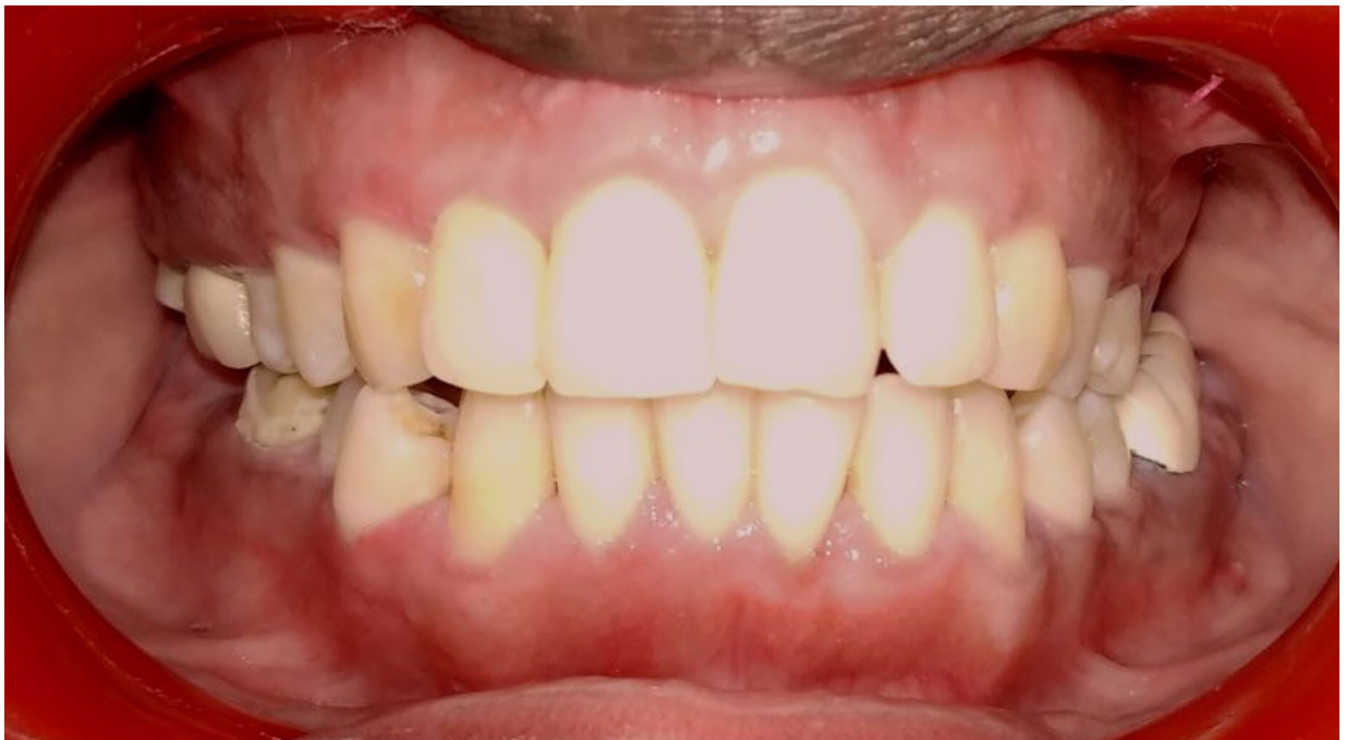
Figure 6. One-year follow-up picture (front profile)