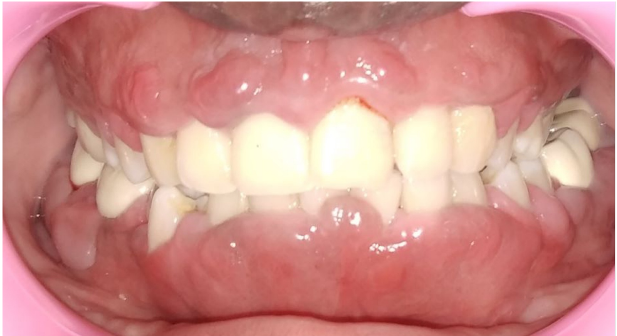
Figure 1. Pre-operative picture of gingival overgrowth (front profile)