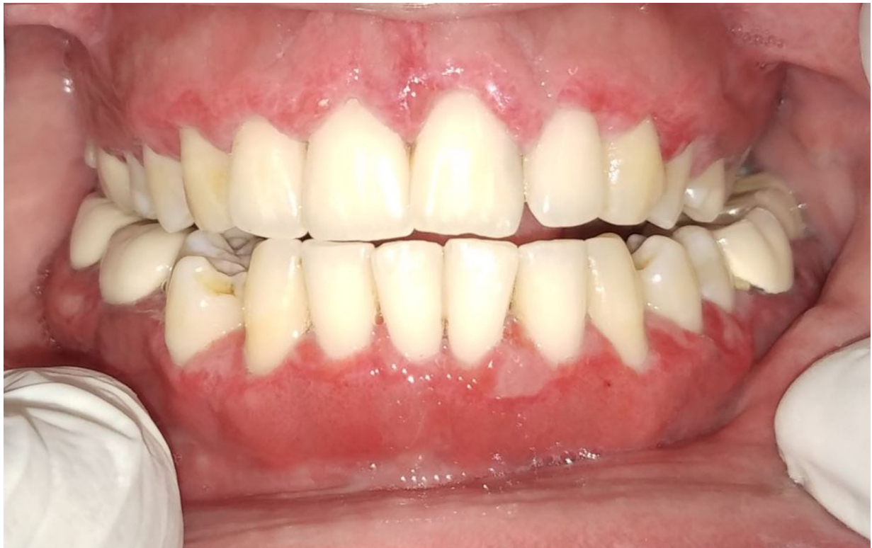
Figure 3. One-week follow-up picture (front profile)