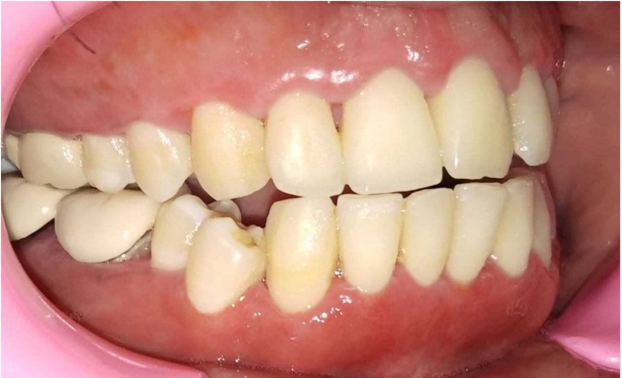
Figure 5. Three months follow-up picture (right profile)