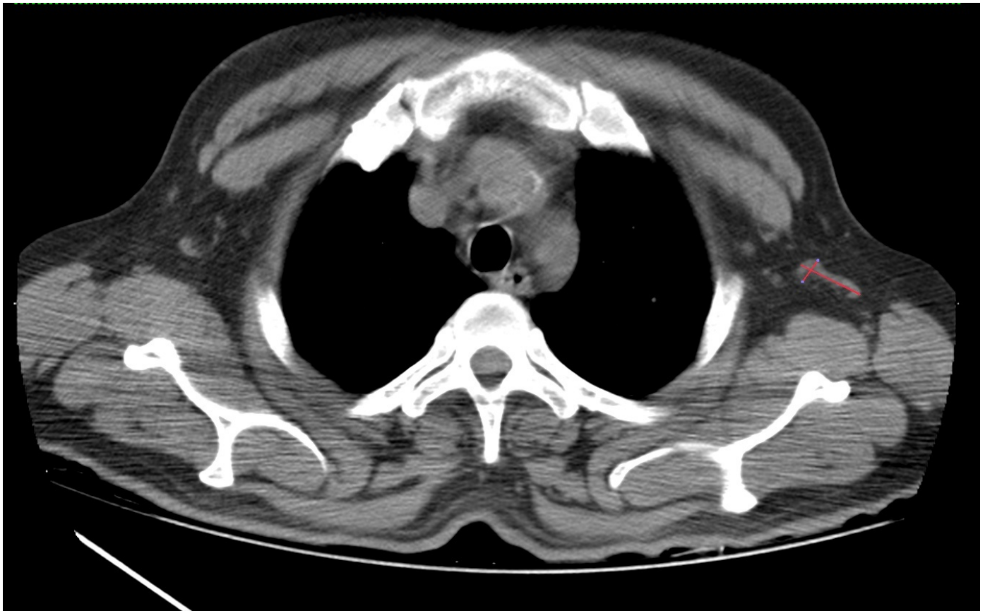
Fig.1. CT Chest non-contrast axial images: Measurement of left axillary enlarged lymph node post vaccination.