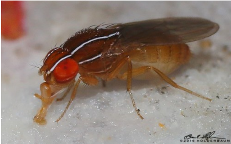
Figure 2. Zaprionus indianus Gupta, 1970 (Diptera: Drosophilidae).

The genus Zaprionus (Coquillett, 1902) is made up of 56 species, and Z. indianus seems to be the only species spreading out around the globe, mainly due to international fruit trading. This Drosophilidae is probably from Africa, where it was registered in fruits of 74 plant species. The first record of the occurrence of this fly in the American continent refers to samples observed in persimmon fruit in Santa Isabel, São Paulo. Its polyphagy and relatively fast development in hot weather environments have contributed to its setting and dispersion. The fig production recorded a loss of 50% in the state of São Paulo due to this fly (Figures 2-3) [12-15].