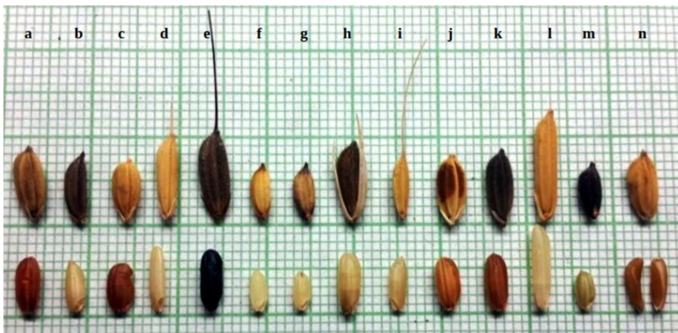
Fig. 2. A Glimpse of Rice ( Oryza sativa ssp. indica ) Genetic Diversity: showing rice grains (top row) with diverse awn size and colour (labelled d ), ( e ), and ( i ); extra-long sterile lemma ( h ); and kernels (bottom row) with notched belly ( c ), black kernel ( e ) and double-kernel ( n ).