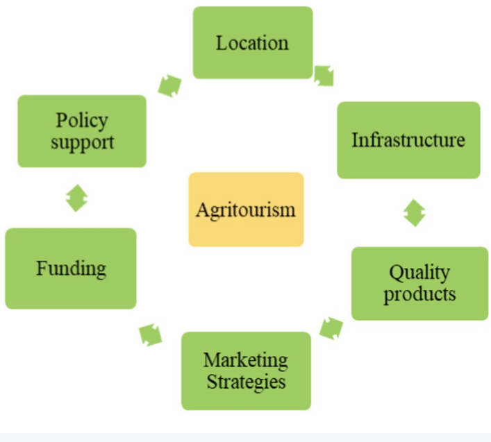
Figure 1. Model for agritourism transformation