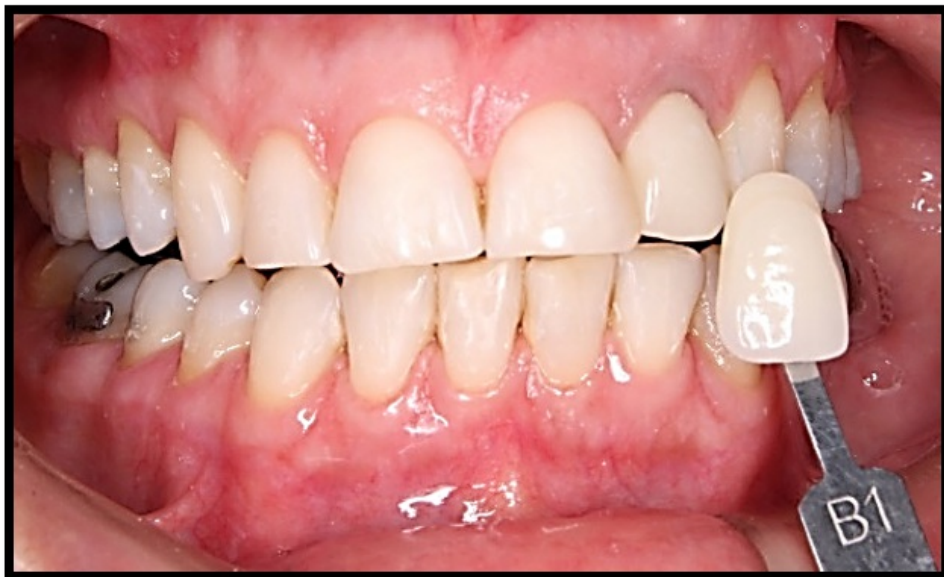
Figure 7. Final Photo - Clinical Case - CBT Patient