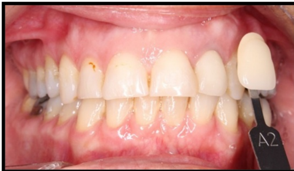
Figure 4. Evaluation of tooth color using the Vitapan Classic scale.

To have better access to the teeth during treatment, the lip retractor was allocated and positioned with a flexible shank or sucking tip between the first molars, allowing mandibular stability throughout the whitening procedure. The protective barrier of gingival tissue was cured with light (Top Dam, FGM Dental Products, Joinville, SC, Brazil) by photoactivating it for 10-20 seconds with the BMW system device itself.