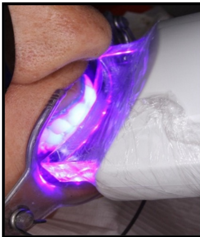
Figure 5. Application of violet light with BMW device.

After the end of the irradiation, the gingival barrier is removed with the aid of an exploratory probe. The polishing of the tooth enamel surfaces is performed using a Robson brush with a pumice stone or associated with an extra fine-grained diamond paste (Diamond Excel, FGM Dental Products, Joinville, SC, Brazil). Written caution guidelines should be given to avoid ingestion with foods and beverages containing dyes.