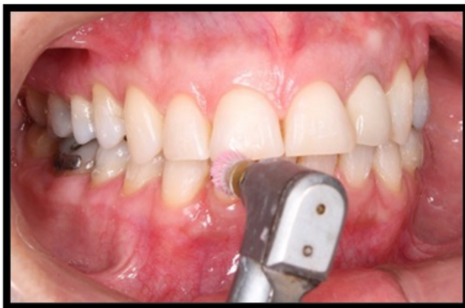
Figure 3. Tooth polishing with pumice diluted in water.

Clinical and radiographic examinations were performed, and the patient signed an informed consent form for tooth whitening. Then, prophylaxis was performed using Robinson's brush and pumice paste with water at low rotation. (Figure 3)