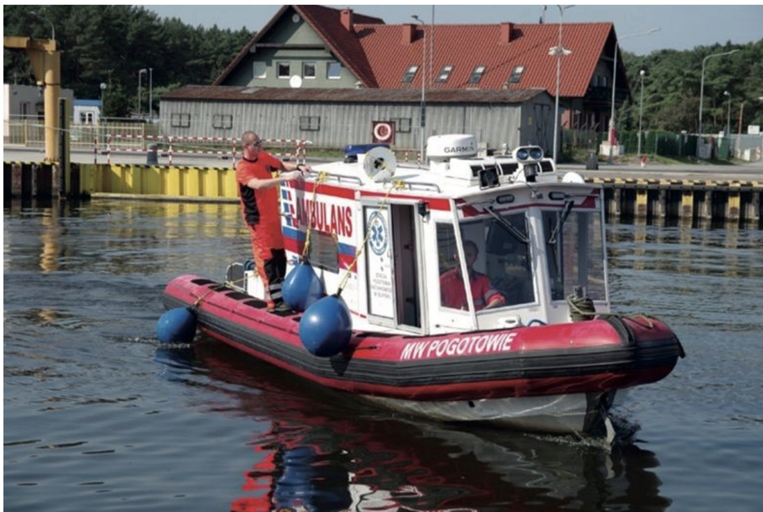
Picture 2. The G1512W Maritime Medical Rescue Team in the Port of Ustk [16]

To what extent can paramedics make a difference in diving emergencies?