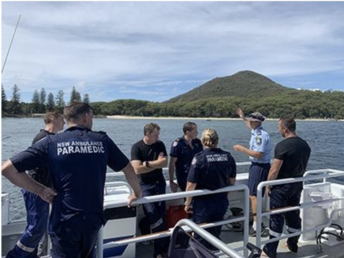
Picture 1. Paramedics training with NSW Police — Port Stephens Marine Area Command