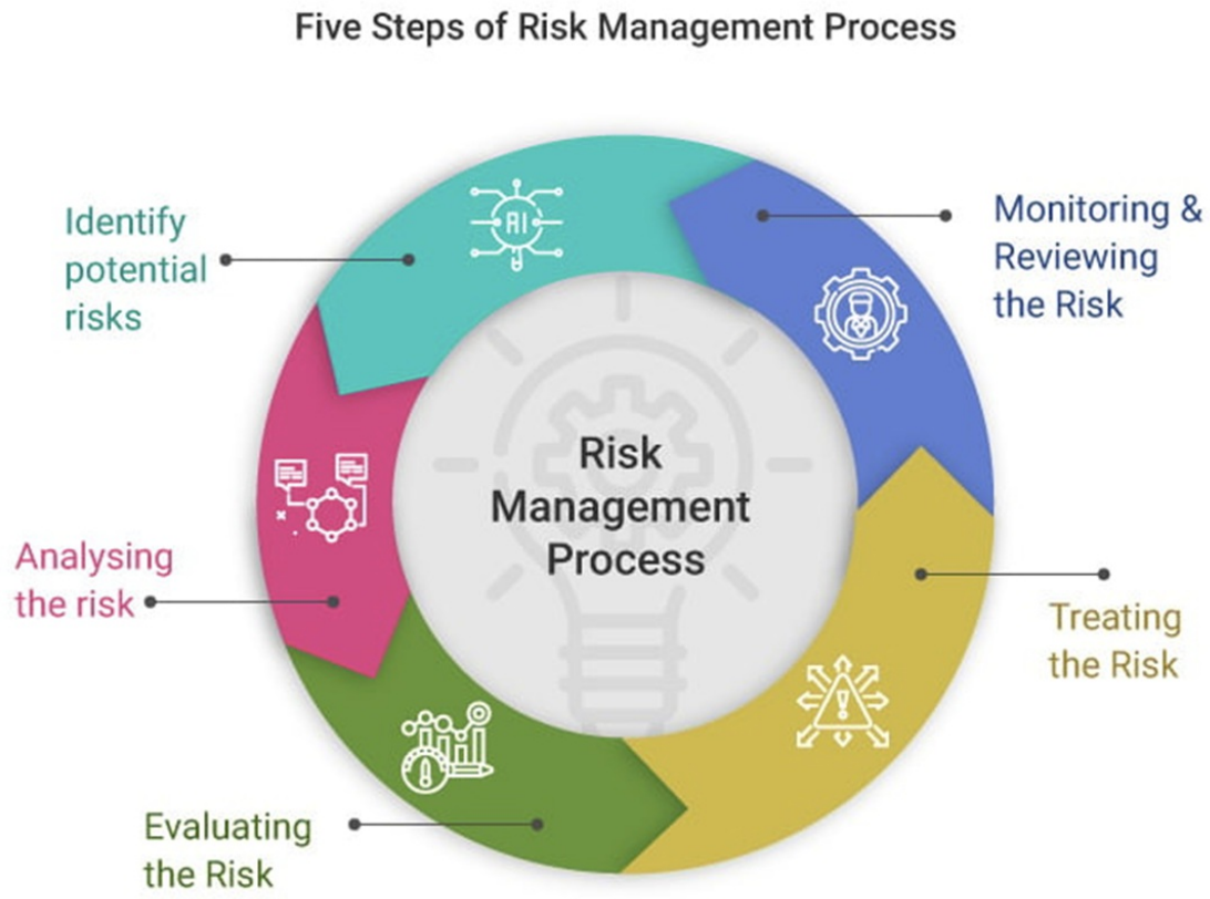
Fig.2. Risk Management Process [28]

decisions to enhance the likelihood of successful project outcomes [28].