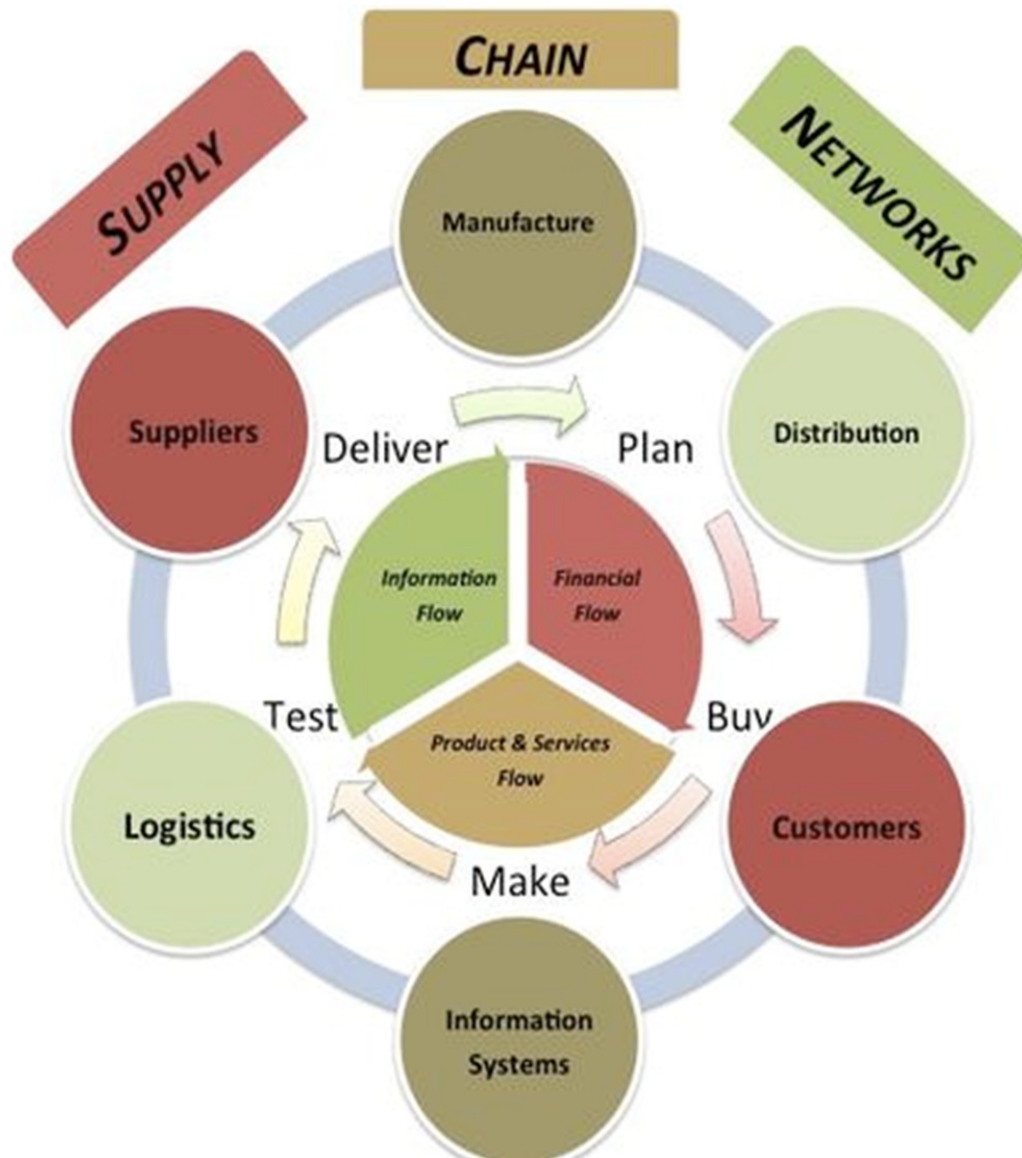
Fig.1. Supply Chains Construction and Networks [14]

Supply Chain Management (SCM) in the construction industry involves the examination and management of interactions and integration among stakeholders throughout the provision of goods and services, from material extraction to consumption. Construction Supply Chains (CSCs) are unique due to the heterogeneous nature of construction projects and temporary contractual relationships. CSCs form networks of stakeholders engaged in value-adding activities within the construction industry, requiring effective management practices to overcome inherent challenges [15].