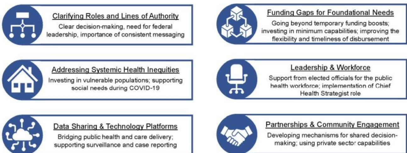
Figure 3: Chart showing key public health challenges during COVID-19 pandemic (CDC, 2020).

To be ahead of epidemics and endemics, we need to focus on the following problems: 1) Health of whole life span, 2) Environmental health and to build the environment, 3) Integrate health into strategies (Li et al. , 2021), 4) Develop