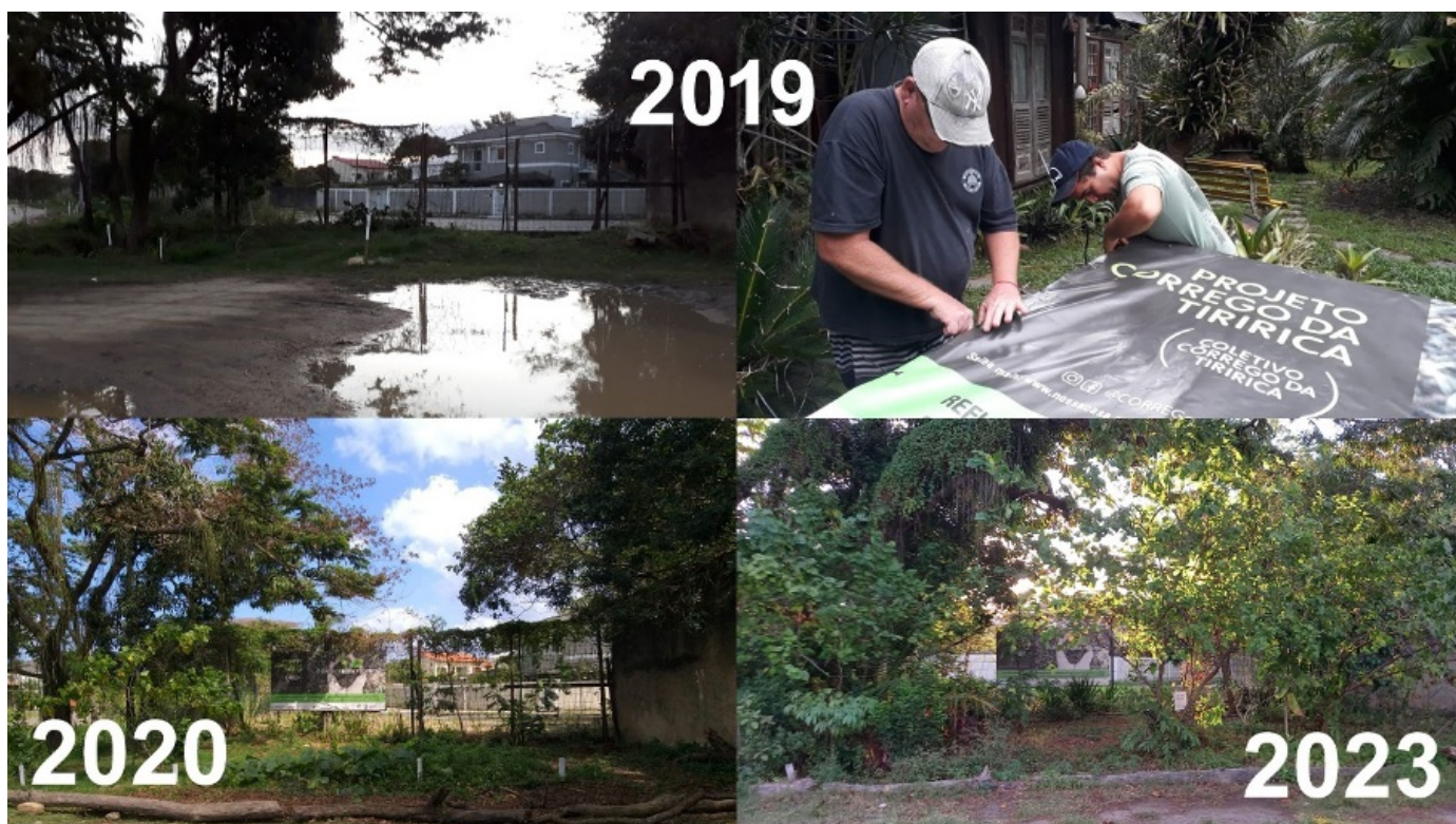
Figure 5. Evolution of the project's entrance garden space and installation of the information sign, on the Francisco da Cruz Nunes road, where the river leaves the tunnels stretch and starts to run in the open.

Aquatic life- Urban rivers function as green corridors, connecting the Tiririca mountain range to the Itaipu lagoon, allowing the circulation of animals and the dispersal of forest seeds in the urban space.