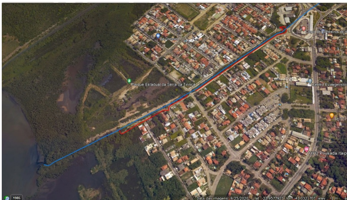
Figure 1. (A) Micro-basins of the Itaipu-Piratininga lagoon system, with indication of the main contributors (Jacaré River and João Mendes River). Ecobarrier of the João Mendes River and location of the plant recovery stretch in the Colibris stream, with springs in the Serra da Tiririca State Park. Adapted from the Guanabara Bay Matrix Topographic Map SF-23-Z-B-IV-4 of 1:50,000. (B) Satellite image with the riparian vegetation recovery site (Google Earth view).

The Colibris stream, the object of this study, has its headwaters within the Serra da Tiririca State Park, upstream of the Colibris stream trail, accessible by Scylla Souza Ribeiro Street, in the Peixoto neighborhood in Itaipu, Niterói. The fluvial valley of the Colibris stream is a region covered by secondary vegetation, in the process of regeneration for more than 50 years and includes the swamp of Pacas, a flooded area associated with the forest. Downstream of the protected area, the stream continues channeled, crossing the Peixoto neighborhood, and emerges in its final stretch after crossing the Francisco da Cruz Nunes road downstream of the 4th GMAR fire station. In its final course towards the Itaipu lagoon, the Colibris stream had its path rectified, bordered by Boa Vista Avenue. The entire Boa Vista neighborhood corresponds to an occupation area which originally was the floodplain of the Itaipu lagoon. In a stretch of 420 meters along Boa Vista Avenue, the first stage of the process of restoring the riparian forest with syntropic agriculture began. (Drone video 1- drone footage of the situation of the Tiririca stream at the beginning of the project). A second sequential stretch to the east of another 260 meters was started in 2023, making a total of 680 linear meters of stretches under recovery towards the mouth of the Itaipu lagoon.