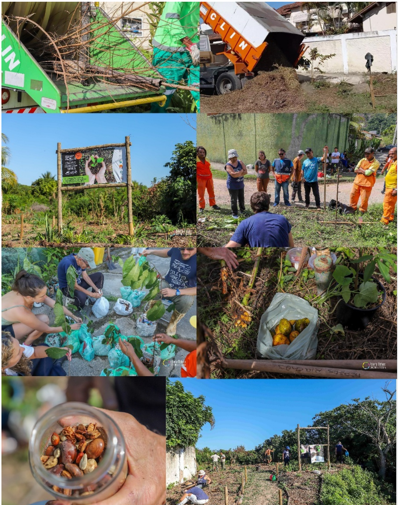
Figure 4. Stages of the planting process using syntropic agriculture. A. Picadeira used for shredding branches and dry vegetation. B. Pricked matter to incorporate into the soil. C. Project site sign posted at the end of O. D. Street. Teachings on nest building. E. Separation of seedlings for planting. F. Fruit eaten, seed planted (cocoa and cajá). G. Muvuca seeds used for planting. H. Maintenance of the space after the incorporation of