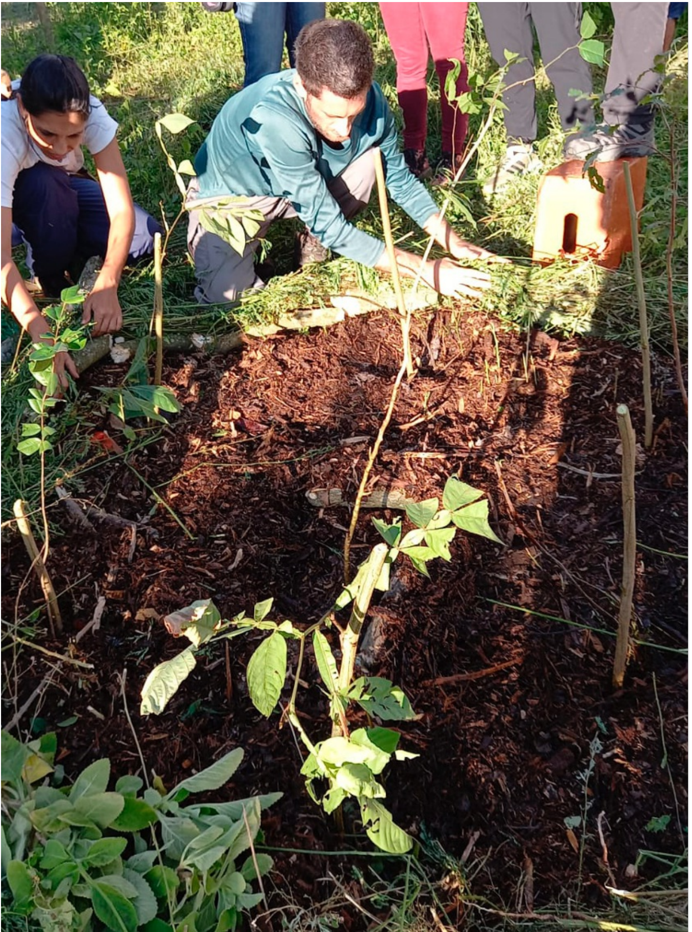
Figure 3. Nest building by volunteers. At the middle a Sapucaia tree ( Lecithis pisonis ). Together with the main tree, different seeds were left on the substrate in a unique nest. Around the nest pieces of wood and herbs to facilitate drainage of water.