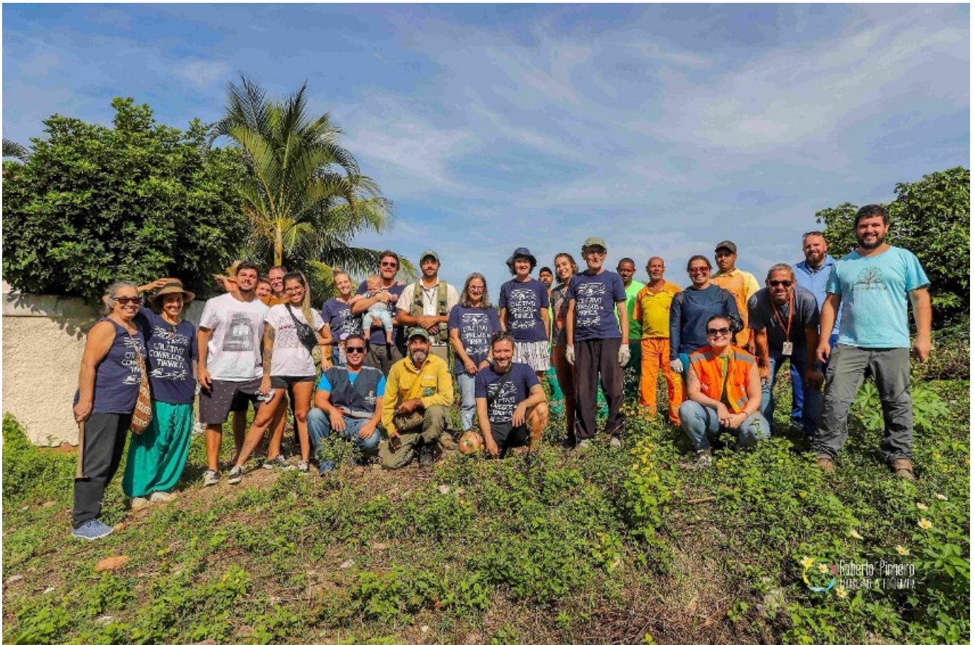
Figure 2. Eighth joint effort held on April 12, 2023, the first collective event organized after the pandemic.

Syntropy. Agroecology can be understood as the application of ecological concepts to design sustainable agroecosystems, in practices that lead from the simple to the complex (Andrade, Passini, 2022). Syntropic agriculture is a model of agroecological planting where fertilizer, poison, inputs and even irrigation are dispensed with. The supply of organic matter is done through pruning, which generates its own substrates for the composition of the soil. In an agroforest, there is a temporal succession of plant species, which are plants that coexist with each other, but have their different objectives when it comes to occupying space. The first step was to mow the abundant grass, dumping the cut vegetation on the spot. From the moment the land became accessible, the assembly of the nests began. The name "nest" (or cradle) refers to life, a place to grow living plants. The nests were set up by digging the soil to a depth of approximately 20 cm or more, enough to house the seedlings (Figure 3).