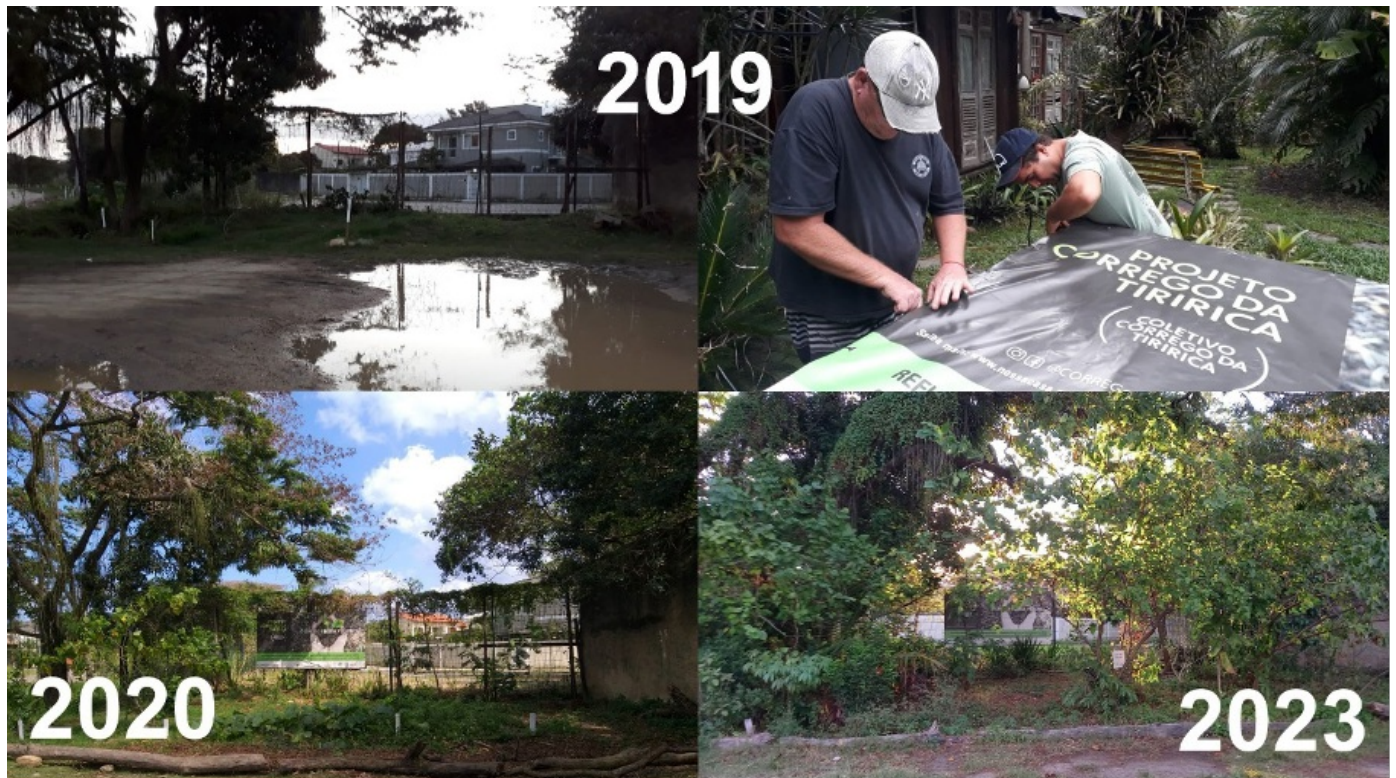
Figure 4. Evolution of the project's entrance garden space and installation of the information sign, on the Francisco da Cruz Nunes road, where the river leaves the tunnels stretch and starts to run in the open.

Aquatic life- Urban rivers function as green corridors, connecting the Tiririca mountain range to the Itaipu lagoon, allowing the circulation of animals and the dispersal of forest seeds in the urban space.