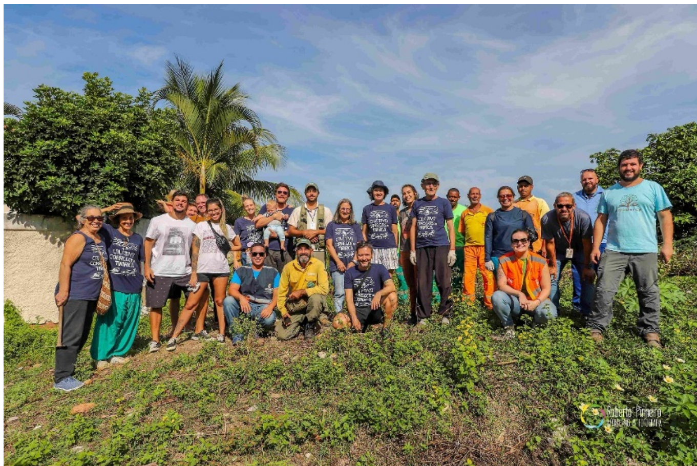
Figure 2. Eighth joint effort held on April 12, 2023, the first collective event organized after the pandemic.