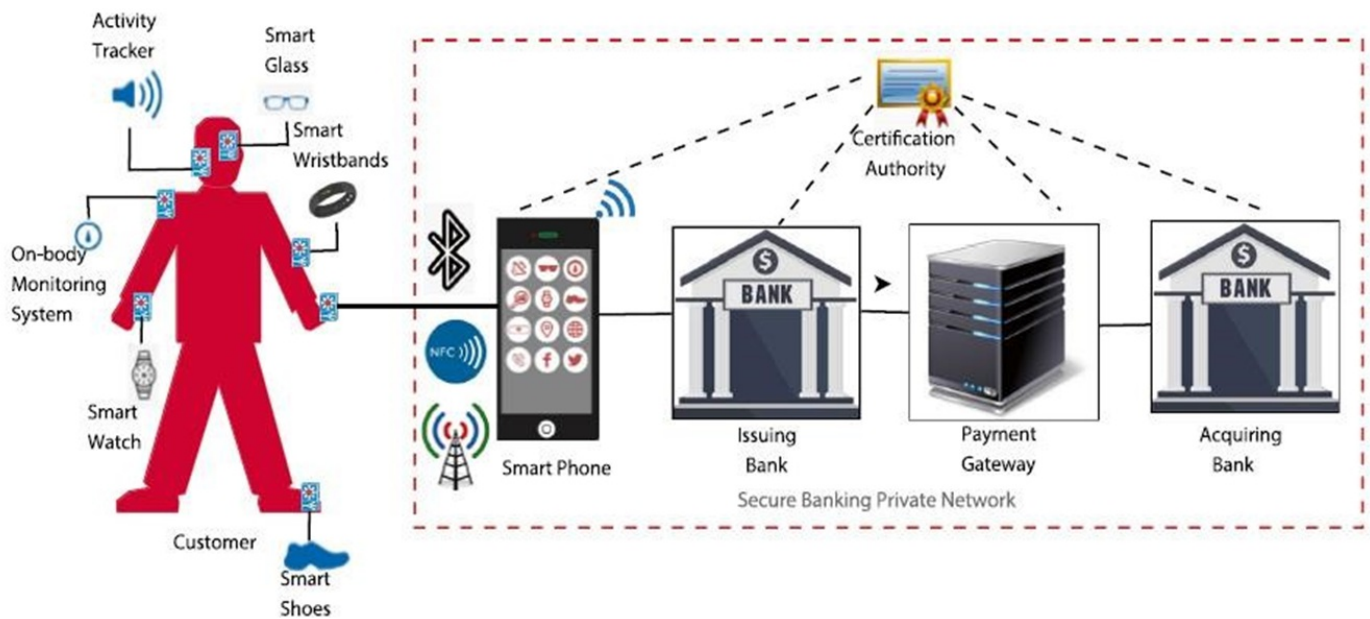
Figure 1. Architecture for wearable devices [16]

By incorporating blockchain technology into the current wearable payment system, this study seeks to propose the structure and functionality of blockchain in the context of protecting financial transactions in the banking and FinTech business. By recording how devices interact, blockchain can help to address the bulk of security flaws and traceability issues in financial transactions. Data security is increased by a blockchain since it is impenetrable and unlikely to be hacked. Blockchain technology may also eliminate trusted gatekeepers for certain apps, enabling the same programs to be operated decentralized and without a central authority. It is now possible to finish the process without sacrificing security or effectiveness, when it was previously impossible. Blockchain properties including immutability, distributed ledger, decentralisation, authentication, transparency, auditability, data encryption, and operational resilience may be used to overcome a variety of IoT architectural flaws [69] .