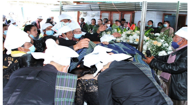
Figure 1. Coronation of the eldest son during the father funeral

their coronation to continue kinship in the next generation. The coronation of the eldest son in the “last attire” during the father's funeral is in Figure 1.