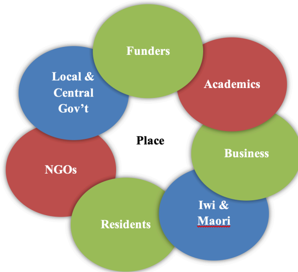
Figure 1. Place is at the center of Community-led Development