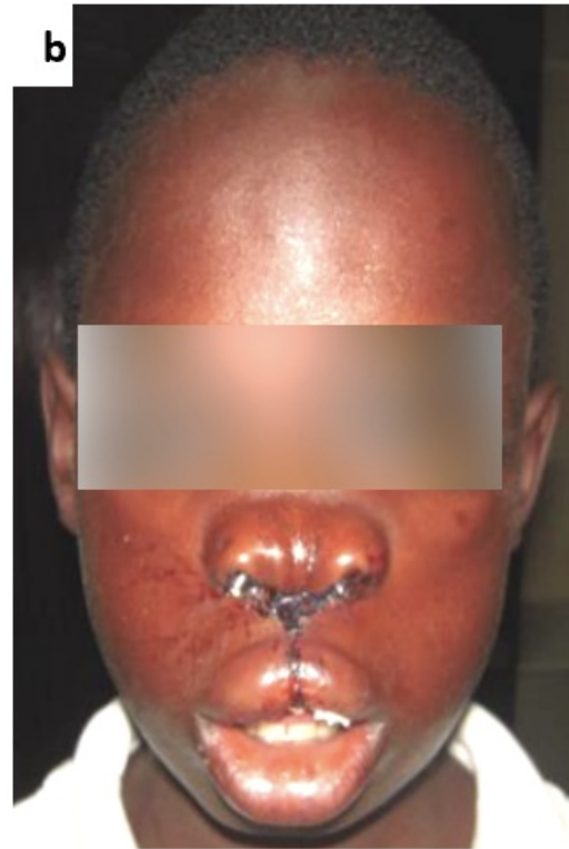
b. After surgery