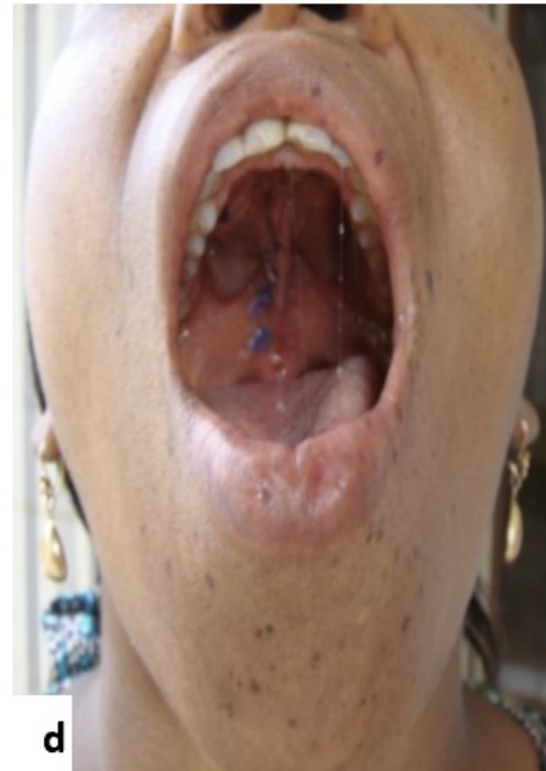
d. After surgery