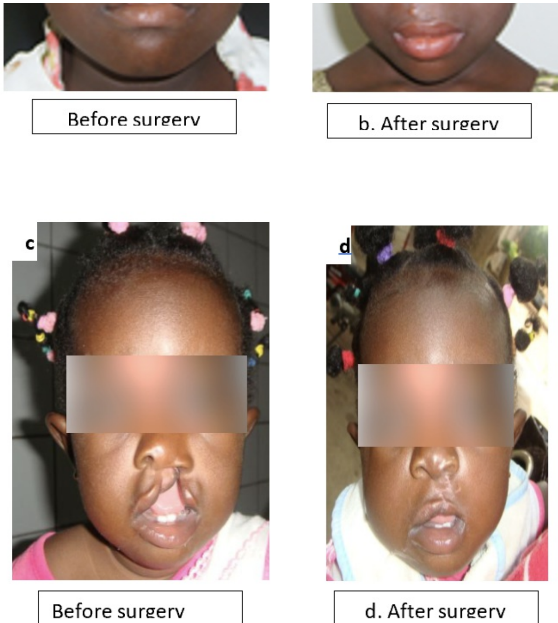
Figure 2. Before and after surgery of a-b: Cleft lip on a 5-year-old girl, and c-d: 1-year-old girl operated in the tenth mission by the local surgeons.