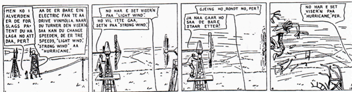
270. Formeget og forlidet skjæmmer ud Too Much and Too Little Are Equally Bad / May 6, 1927

That is, bettering ideas were massively encouraged by a liberal society. It is a matter of unpredictable dynamics, not predictable statics—but dynamics from new ideas, not from mechanical feedbacks (though those happened, too). Look at the cartoon from the long-running series “Han Ola and Han Per” during the 1910s and 1920s in Decorah Posten , the bilingual newspaper published in Iowa for the Norwegian immigrant community. The dialogue is translated into both languages in an edition from the University of Iowa Press: