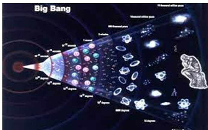
Figure 2. One's inner vision of cosmology

The theory of Big Bang cosmology demonstrates how science should not work. The idea of a beginning occurring after a massive explosion is a myth, and all astronomical data have been interpreted in a way that agrees well with this myth. The first step to demystification is to raise awareness of one's inner image of the Big Bang cosmology. Figure 2 shows the first picture that one sees in their inner vision whenever cosmology is mentioned.